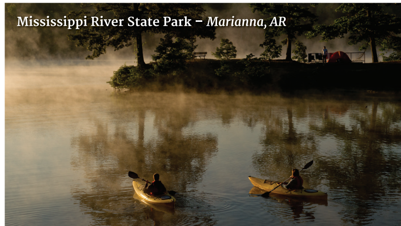
Mississippi River State Park - Marianna, AR