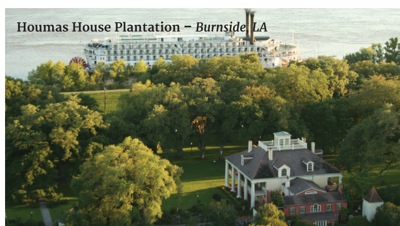
Houmas House Plantation - Burnside, LA