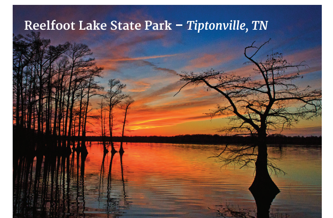
Reelfoot Lake State Park - Tiptonville, TN