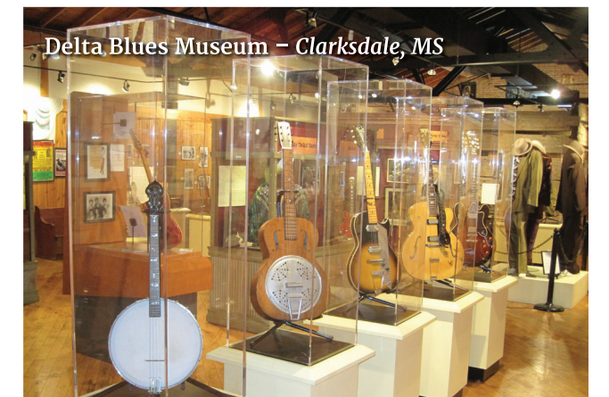
Delta Blues Museum - Clarksdale, MS