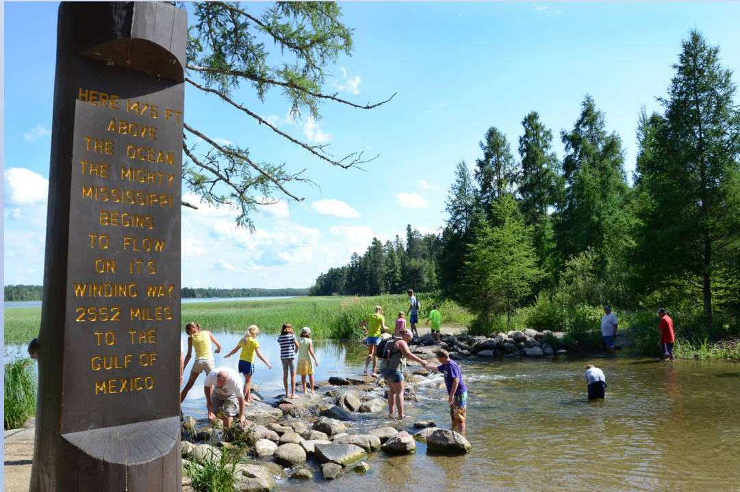
The Iconic Headwaters