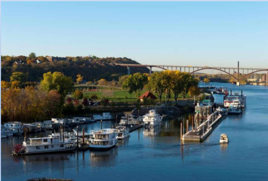
St. Paul Riverfront