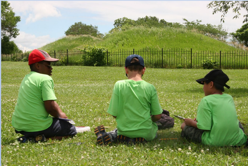
Mounds Park/Dayton's Bluff