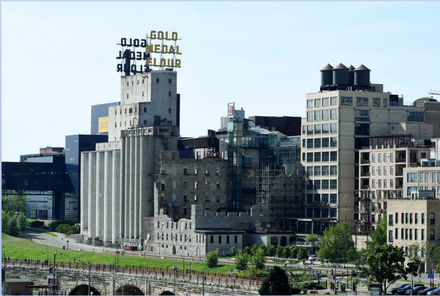
St. Anthony Falls Historic District, Minneapolis