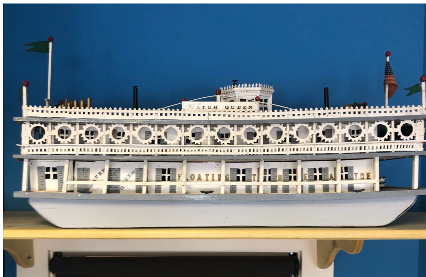
A model of a riverboat. The model is on display.