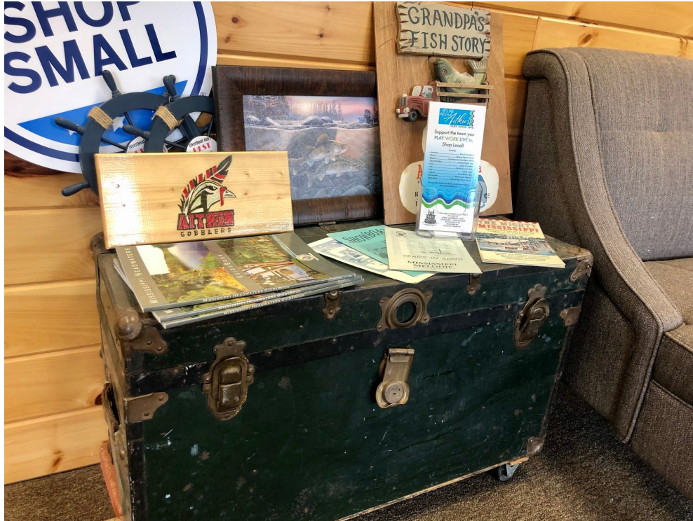
This trunk was salvaged from an old riverboat and was once aboard the Mississippi Melodie.