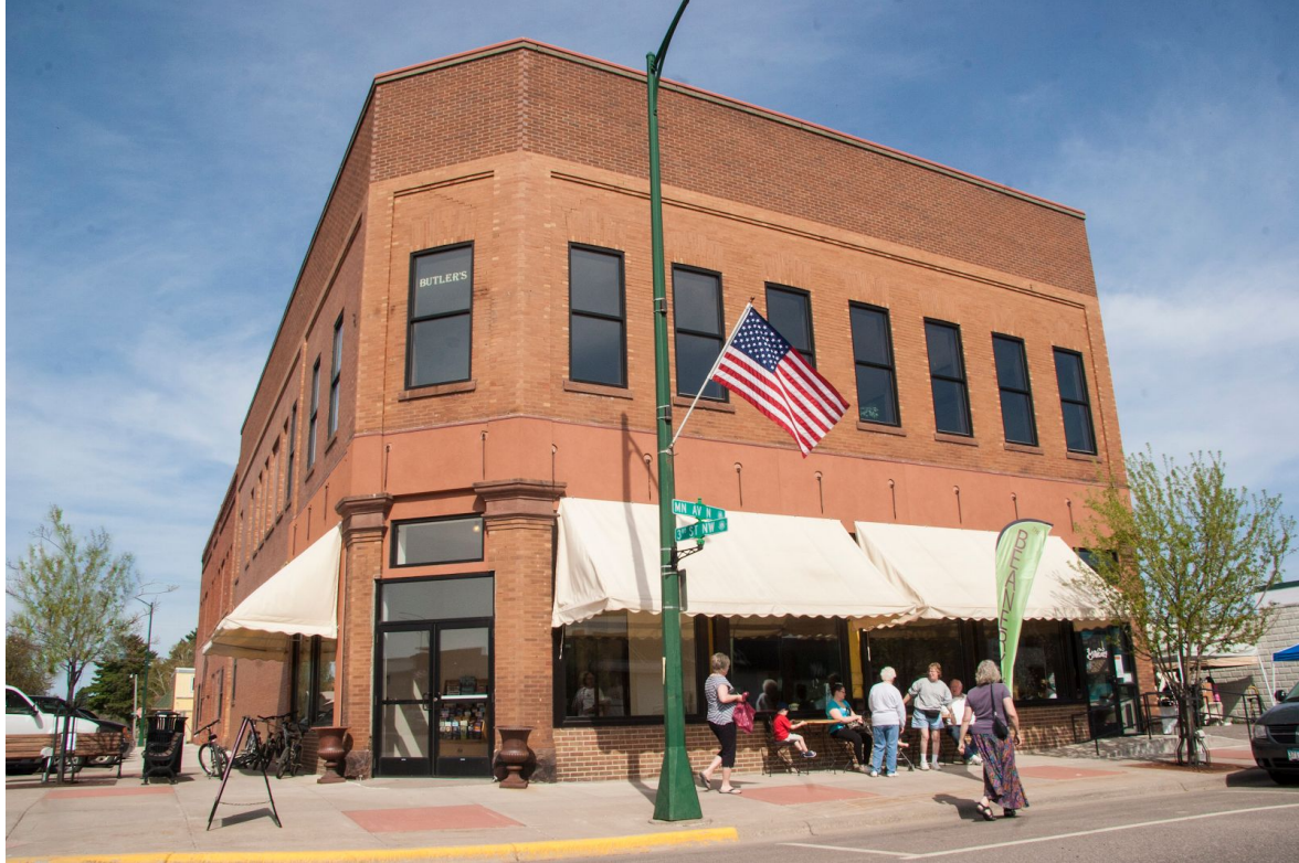
Butler Building Exterior. The Aitkin Area Chamber of Commerce is located in the building. Great River Road signage would be placed at this entrance, which faces the Great River Road.