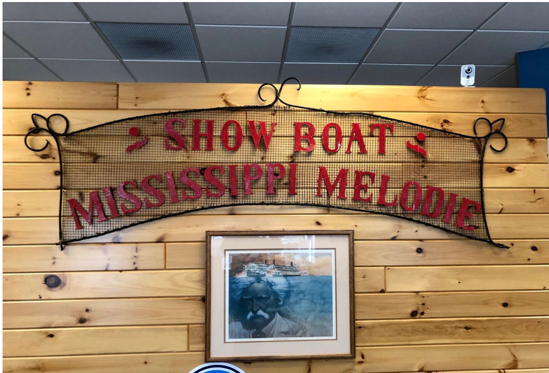
Signage from the original Mississippi Melodie, displayed in the Chamber office.