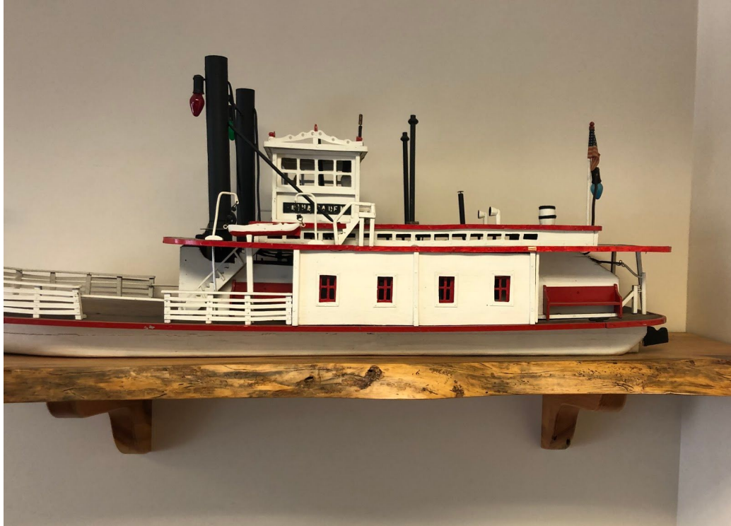
A model of a riverboat. The model is on display.