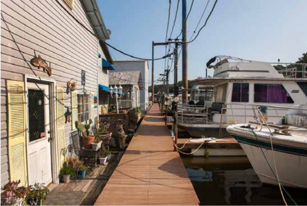
A view of the Riverside Park Marina, on the Mississippi River in Memphis.

There were more trees now, as the land gradually shifted from the agriculture of the delta to the thick bayou forests of southern Mississippi and Louisiana. We drove past the optimistically named river town of Waterproof, and headed back across to Natchez, Miss.