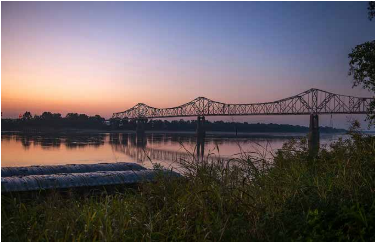
Early morning on the Mississippi River with the Helena Bridge in the background.

Over the course of our road trip, I became slightly obsessed with finding out what was actually in Fort Adams – and I had only that morning to find out. Driving south from Natchez, I turned onto state road 24 at the town of Woodville. On the map, Fort Adams lay at the terminus of the road, which soon left the town behind and entered thick forest. Once in a while, I saw distant wooden houses on stilts. The road continued on, twisting and turning toward the Mississippi.