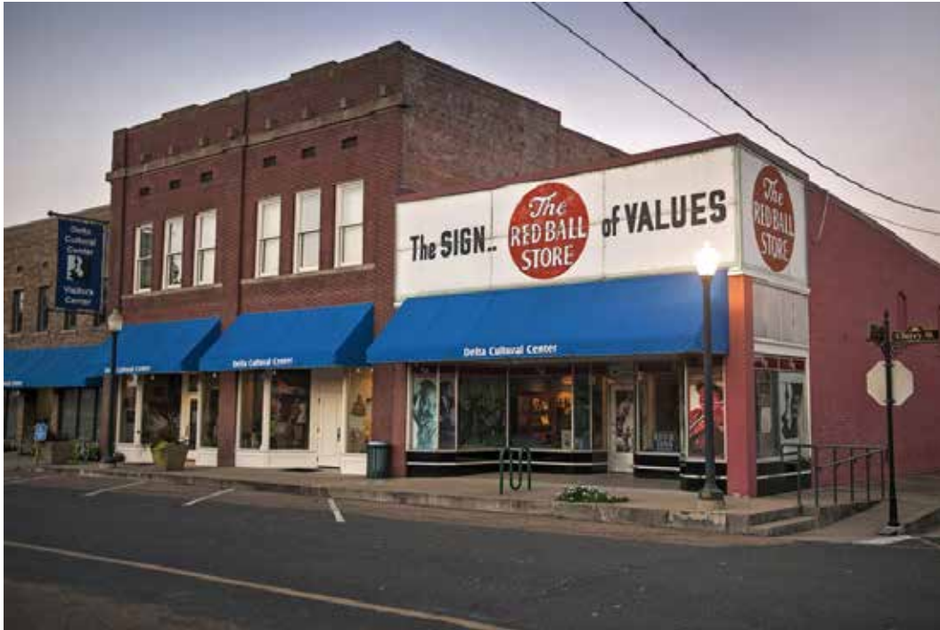
Delta Cultural Center in Helena.

We left Fort de Chartres and passed an old cemetery with a memorial that read, “Here lie buried the remains of Michigamea Indians, early French adventurers, black slaves, victims of wars, massacres, floods and plagues.” We got lost afterward, and drove along a tiny road built on top of the levees. In the distance, something sat in the middle of the road. I slowed down and stopped nearby.