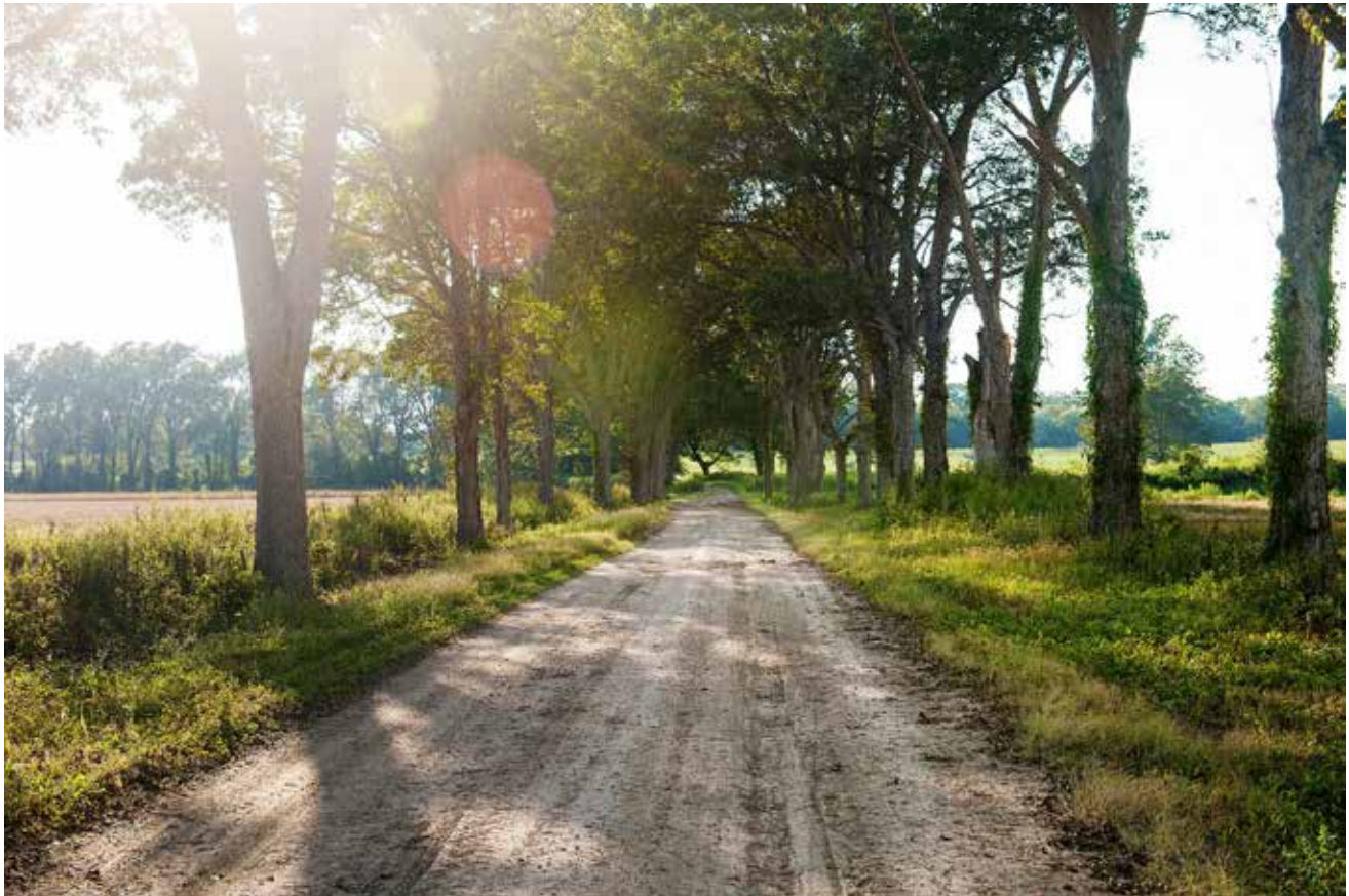
River Road going toward Levee Road in Greenville.

whether we had actually seen the Mississippi River before we crashed all those years ago. She grimaced and shook her head.