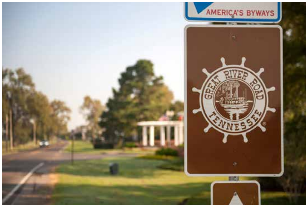
Great River Road in Memphis.

Arsenal Island, like other subsequent stops along the Great River Road, lacked tourists but held many layers of history. Originally the site of a wooden fort that extended American control into the upper Mississippi, it also contained a Confederate cemetery, a National Cemetery, a U.S. Army museum, and 19th-century stone buildings that give the base the feel of a college campus.