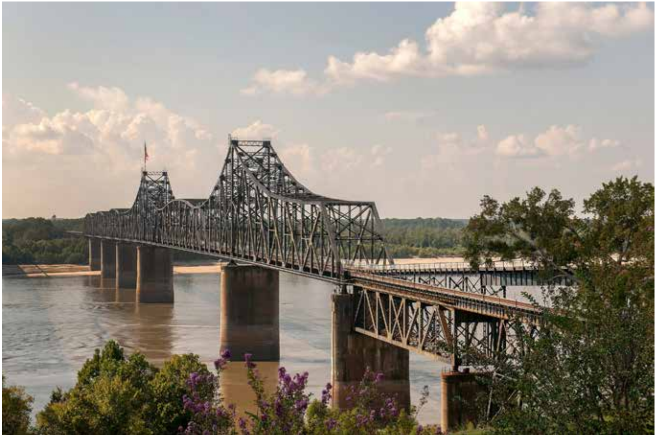
The Old Vicksburg Bridge.

Leaving town, we visited Helena River Park and walked along a wooden pier that soared through trees and stopped at the river's edge. The muddy water ran fast. Everything from twigs to branches the size of trees floated by. Dozens of birds sat in the treetops and chattered loudly to each other. It was around here that the Mississippi started to expand into the land around it. The Great River Road tiptoed around countless oxbow lakes, formed when the river meanders elsewhere and leaves behind trapped water.