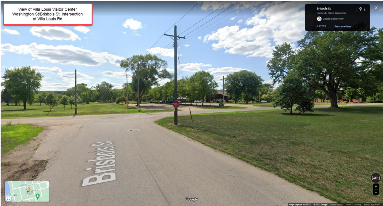
View of Villa Louis Visitor Center Washington St/Brisbane St. Intersection at Villa Louis Rd

Brisbane St Prairie du Chien, Wisconsin Google Street View Jul 2023 See more dates