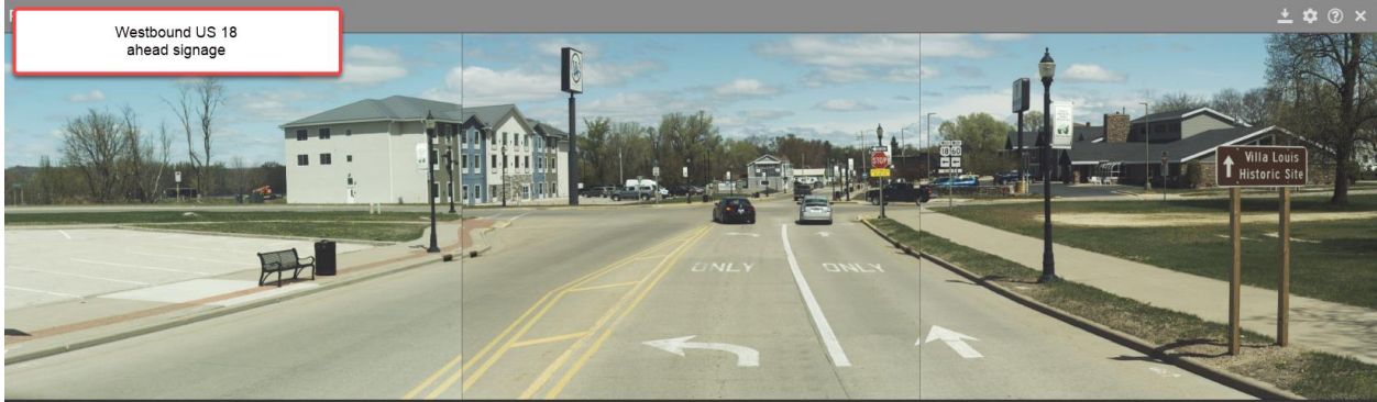
Westbound US 18 ahead signage

RTE: 018E | RGN: 1 | CNTY: CRAWFORD | DATE: 05/01/2023 | SN: 357000 | SURF_YR: 2011 | PVMT: P | PVMT_NB: 8 | STN CUM MILE: 1.337 | COORDINATE: 43.048936, -91.150875