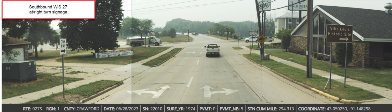
Southbound WIS 27 at/right turn signage

RTE: 018W | RGN: 1 | CNTY: CRAWFORD | DATE: 05/01/2023 | SN: 357110 | SURF_YR: 2011 | PVMT: P | PVMT_NB: 8 | STN CUM MILE: 185.162 | COORDINATE: 43.049599, -91.149272