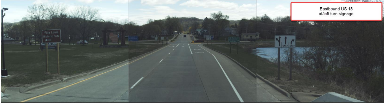
Eastbound US 18 at/left turn signage

RTE: 018E | RGN: 1 | CNTY: CRAWFORD | DATE: 05/01/2023 | SN: 357000 | SURF_YR: 2011 | PVMT: P | PVMT_NB: 8 | STN CUM MILE: 1.337 | COORDINATE: 43.048936, -91.150875