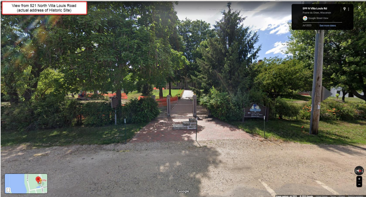
View from 521 North Villa Louis Road (actual address of Historic Site)

Brisbane St Prairie du Chien, Wisconsin Google Street View Jul 2023 See more dates