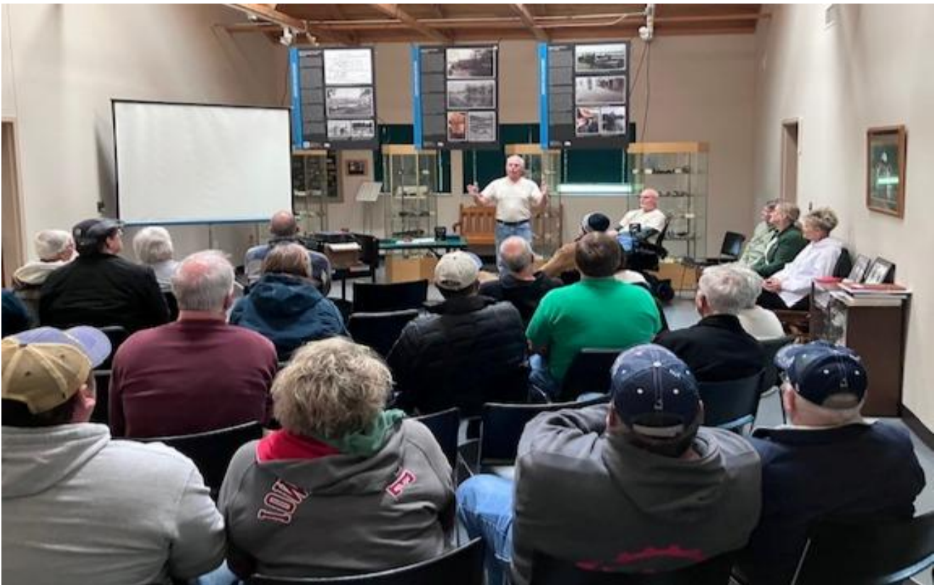
Figure 2. 2024 Earth Day events and celebration at the LACMERS Building at Fairport Fish Hatchery.