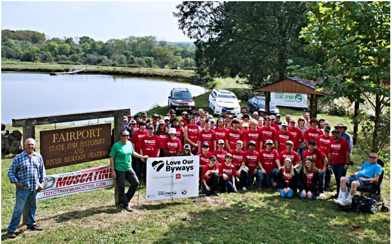
Figure 5. National Scenic Byways and Toyota Work Day group photo of students and United Way volunteers.