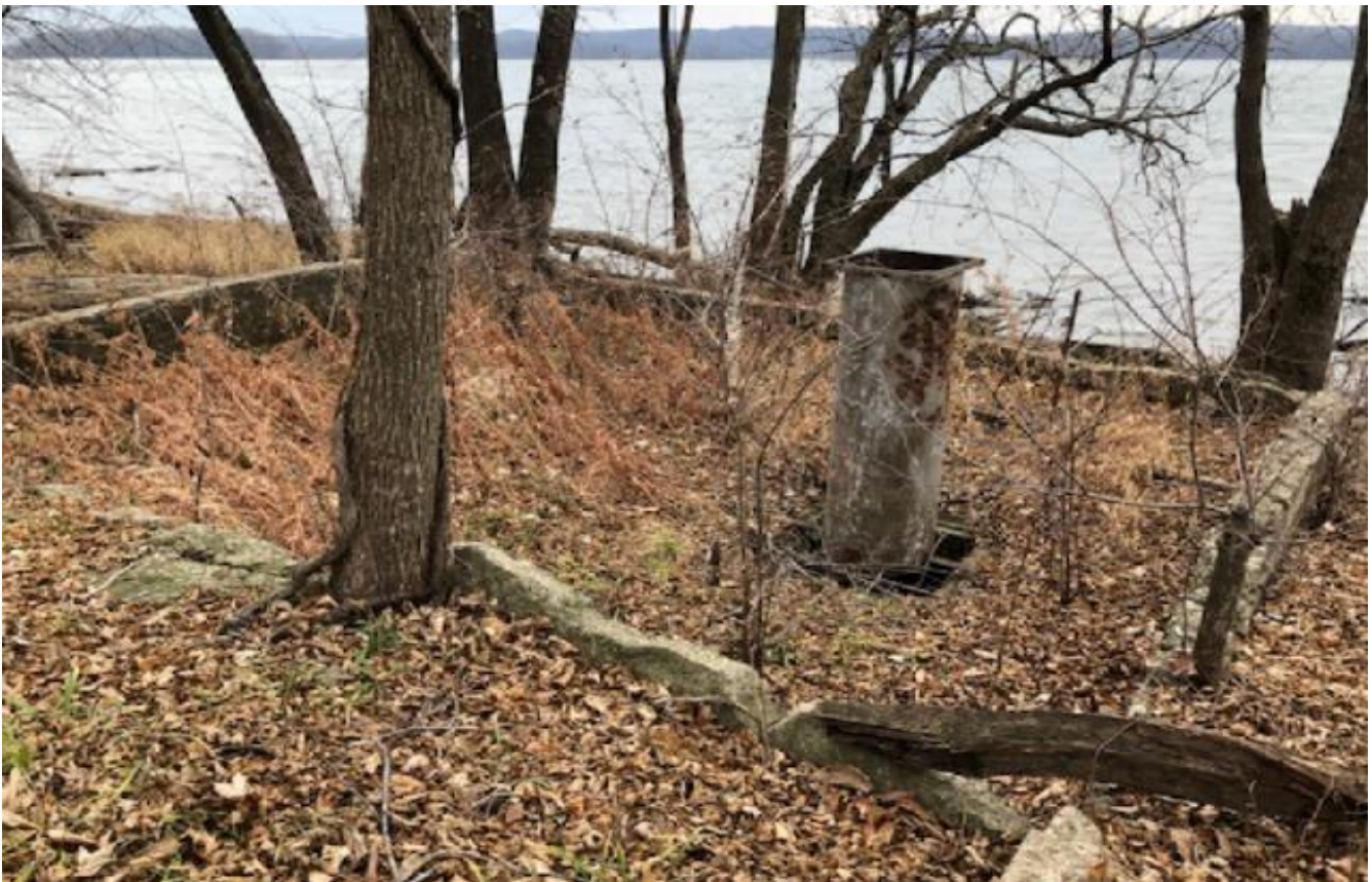
Figure 10. View of the Temporary Pumphouse, former Blacksmith Shop left of photo ca. 75 meters.