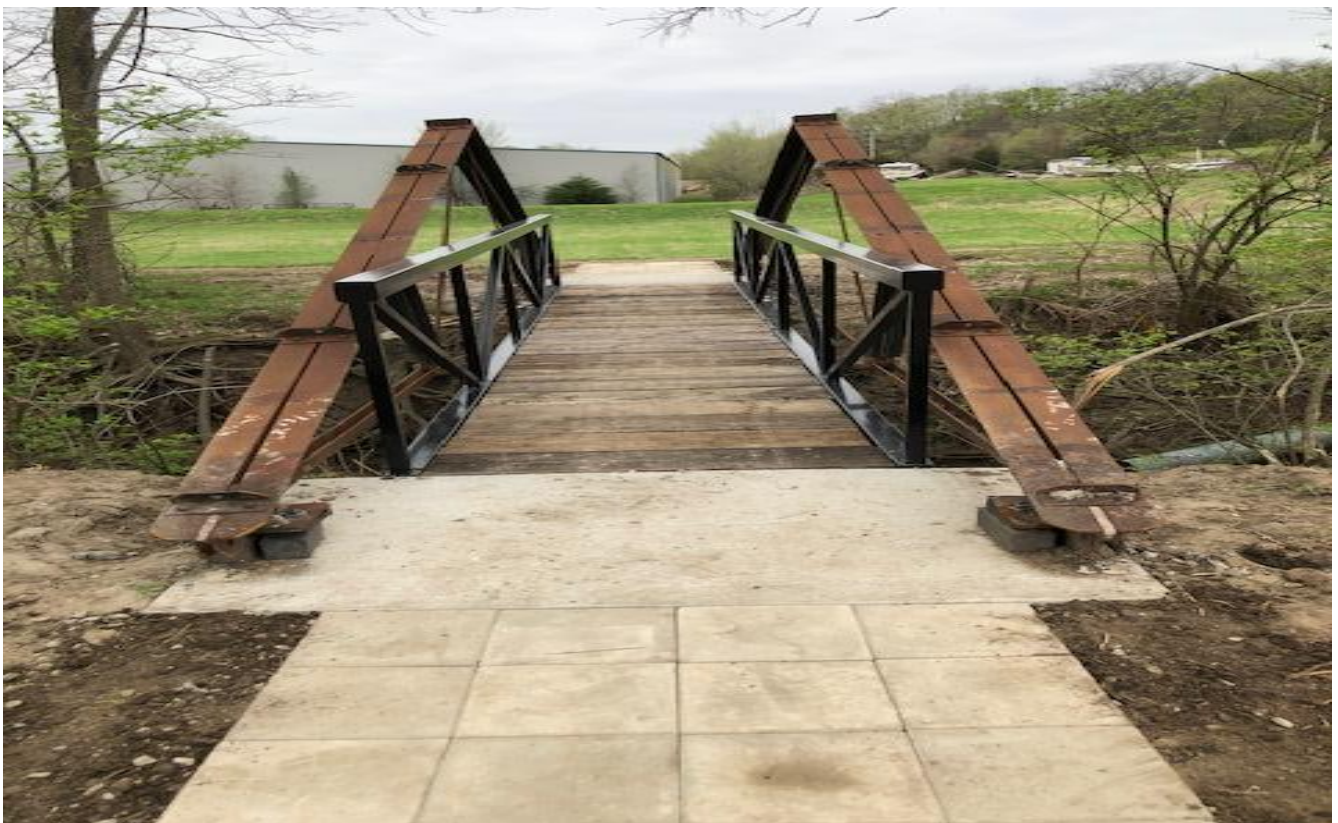
Figure 8. Completed bridge with decorative roof trusses and paving stones, April 2023.