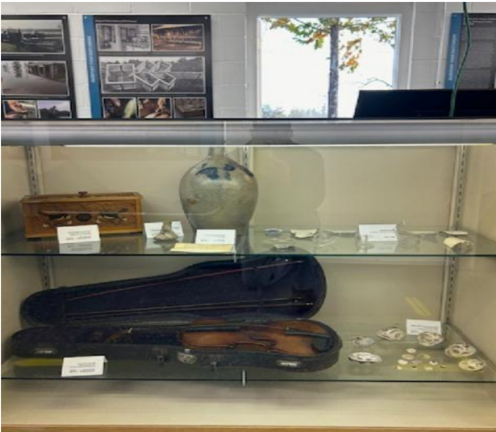
Figure 17. Artifact display case #1, showing carved wooded box made by German POW and his violin.