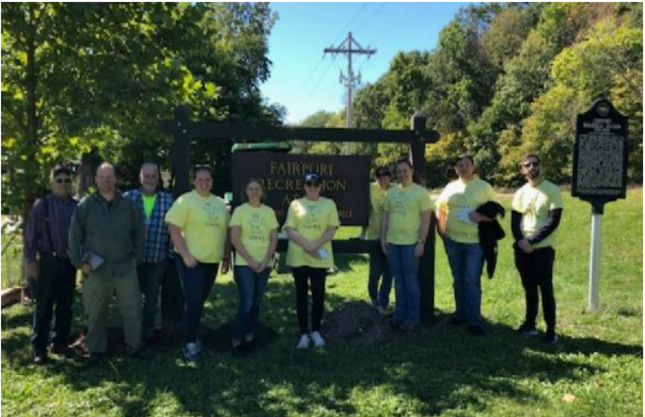
Figure 3. Day of Caring 2022, volunteers by newly installed State of Iowa Historical marker and Hatchery sign.