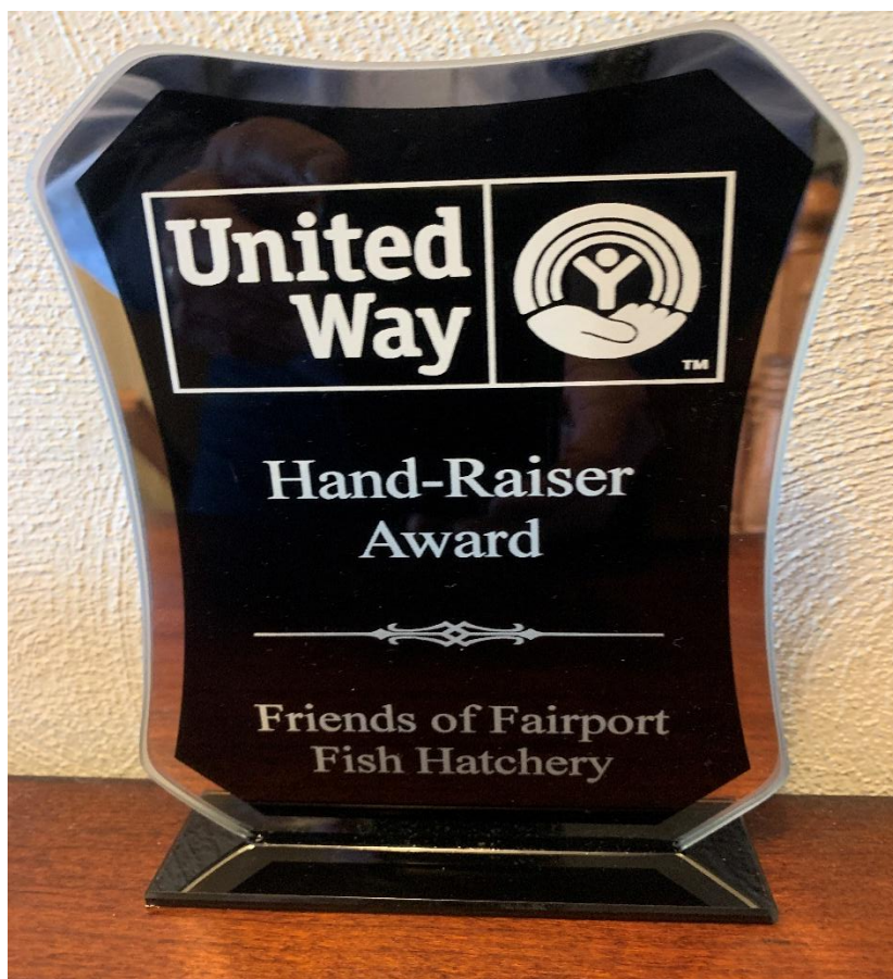
Figure 16. 2024 United Way Hand Raiser Award for most organization with the most volunteer hours in 2023.