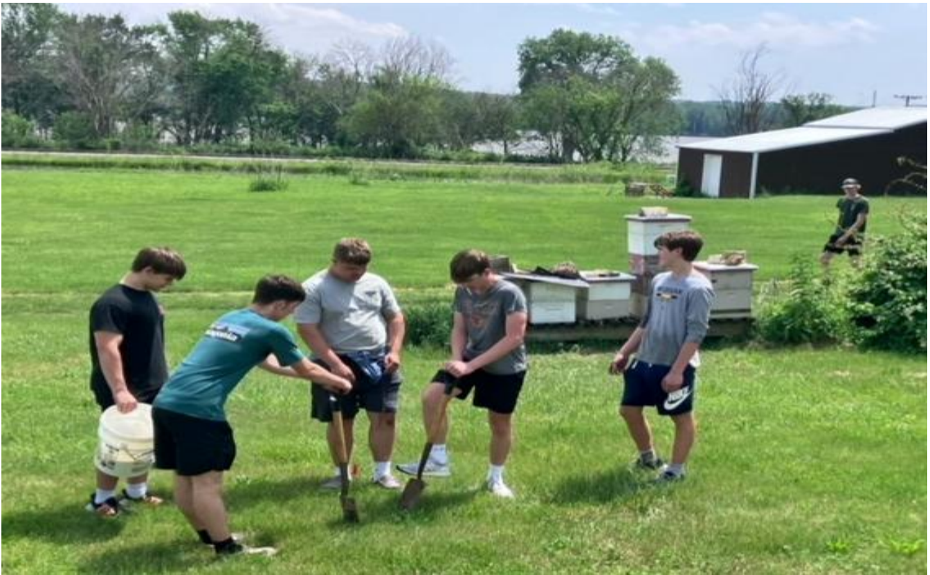
Figure 11. High school students planting red buds near the holding house, May 2024.