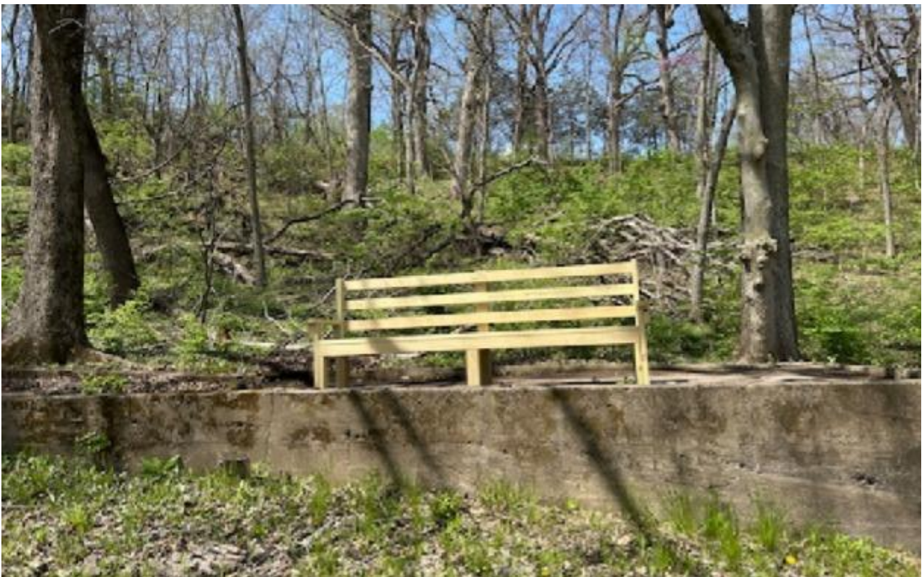
Figure 14. Boy Scout bench on top of garage foundation at the far end of the North Trail.