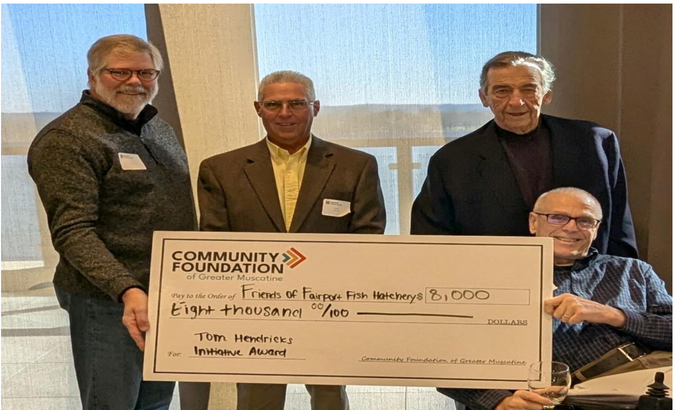
Figure 18. FFFH members accepting the Tom Hendricks Community Service Initiative Award.