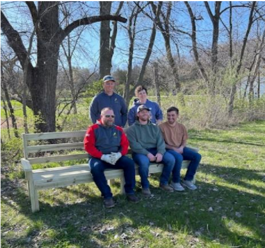
Figure 13. Boy scouts and volunteers sit on one of five benches donated by Boy Scout troop, April 2025.