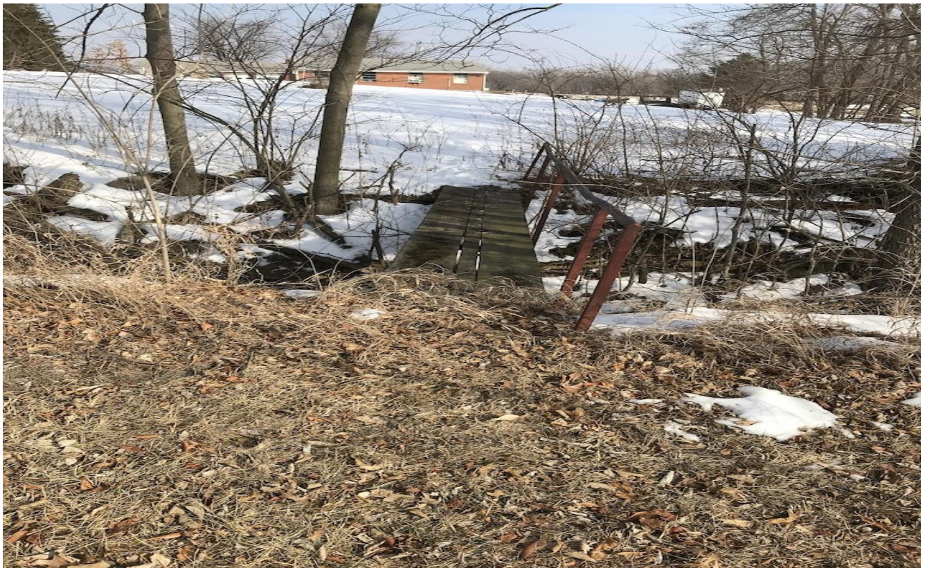
Figure 6. Existing Bridge in January 2022.