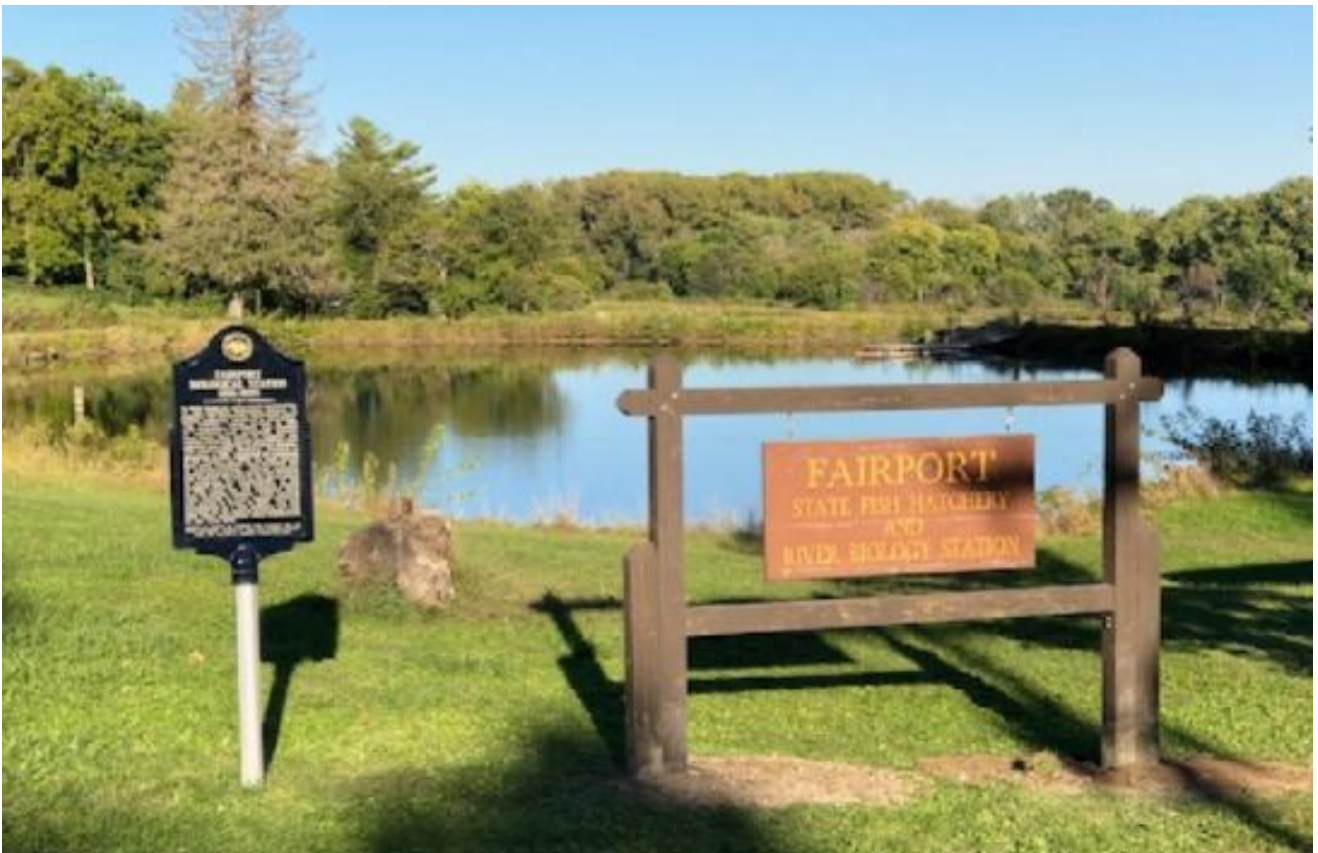
Figure 4. View of State of Iowa Historical marker and Hatchery sign, with original reservoir in the background