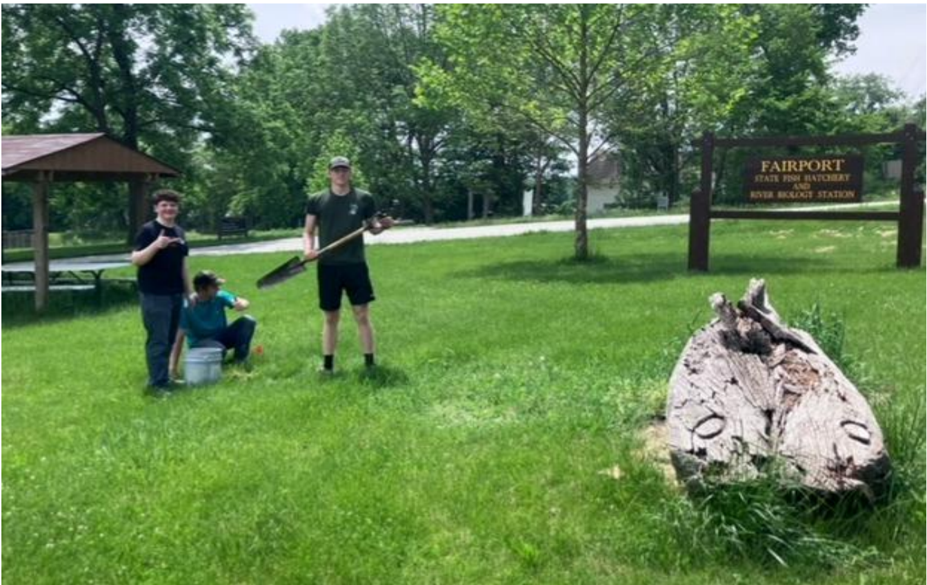
Figure 12. High school students planting red buds near the hatchery entrance, May 2024.