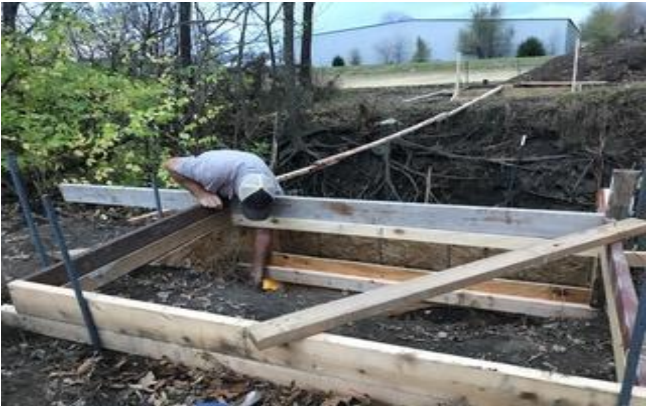
Figure 7. Students assisted FFFH contractors to frame pier footers before pouring concrete in October 2022.