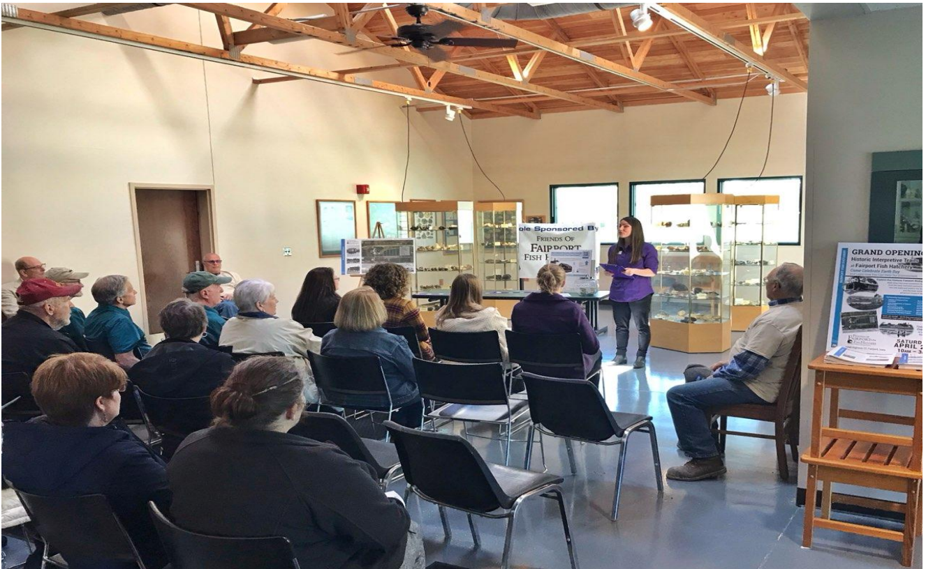
Figure 1. 2023 Earth Day and Ribbon Cutting at the LACMERS Building at Fairport Fish Hatchery.